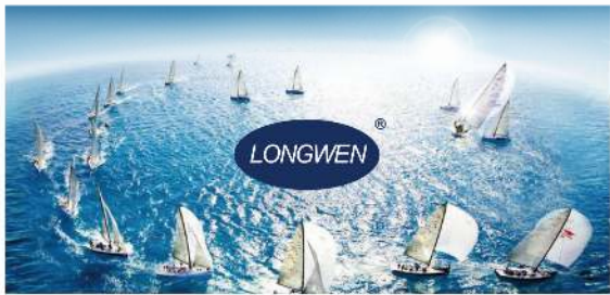
专业团队 Major team