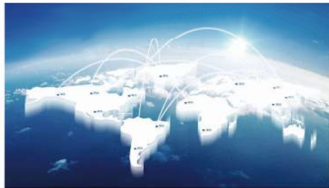
全球服务 Global service