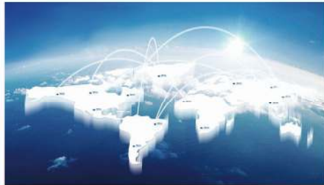
全球服务 Global service