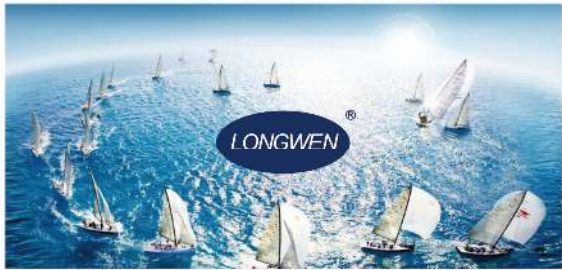
专业团队 Major team